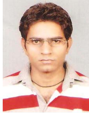
Surendra Singh Dangi Academics, Bhopal