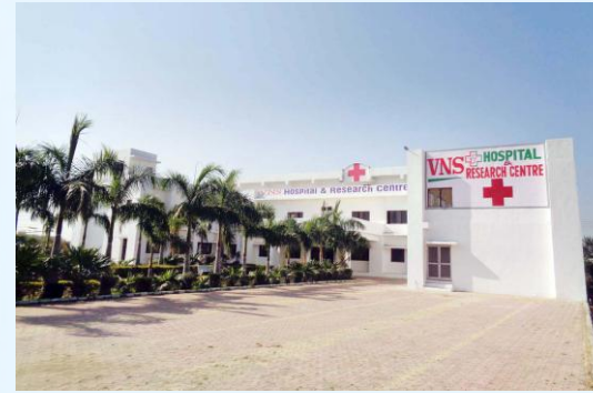
VNS Hospital (A Multispeciality Hospital)