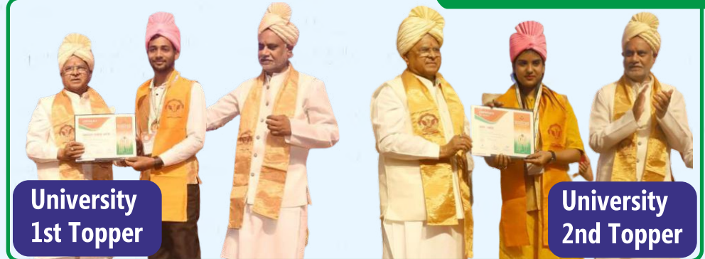
Akhilesh Kumar Gupta Gold Medal (M. Pharm)