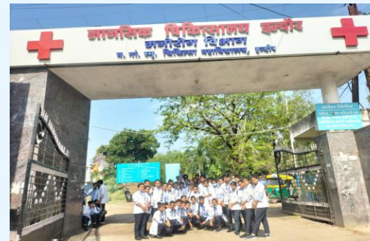
Mental Health Clinical Postings at Indore.