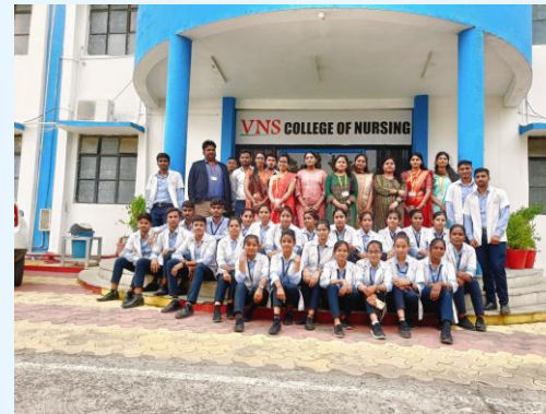
VNS College of Nursing Building