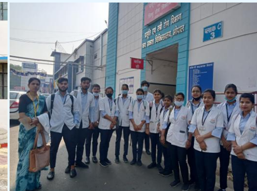
JP District Hospital, Bhopal for Clinical Posting.