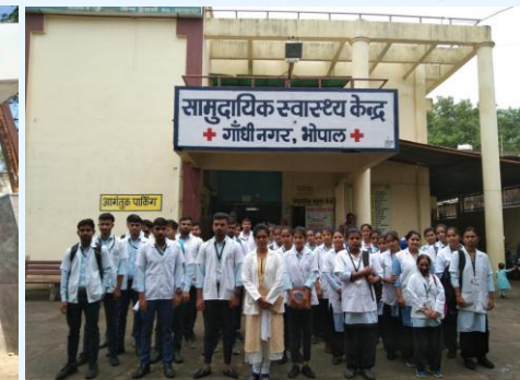
Posting of CHC Gandhi Nagar Bhopal

Save one life, You're a hero. Save 100 lives, You're a nurse.