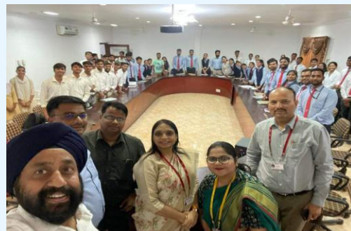
Industry Institute Interface- Team of Havells Ltd.